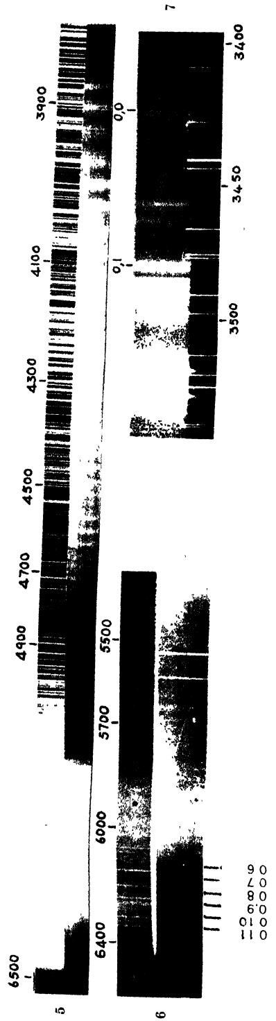
Fig. 5—Thallium iodide bands, system 31 — \Sigma — Fuess spectrograph overall picture. Fig. 6—TlII bands (6338 Å — 5577 Å) — Fuess spectrogram. Fig. 7—TlI bands (3500 Å — 3400 Å) — Quartz Littrow spectrogram.